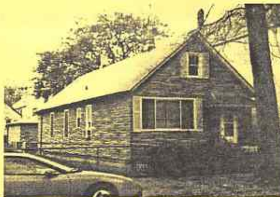
The house at 4839 Throop Street in 1999