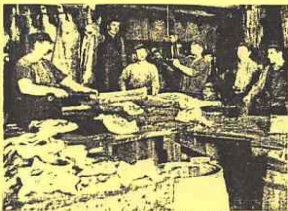
Butchering Hogs in a Packing House