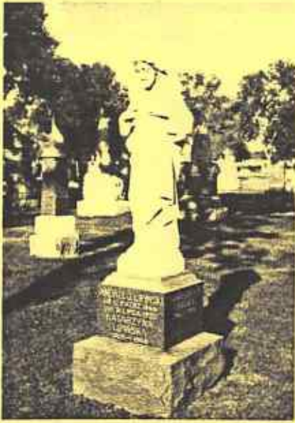
Lipinski Family Monument Resurrection Cemetery, Justice, Illinois